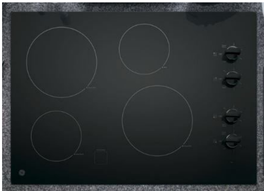
Recalled GE electric radiant cooktop, model no. JP3030DJ4BB