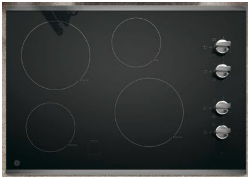
Recalled GE electric radiant cooktop, model no. JP3030SJ4SS